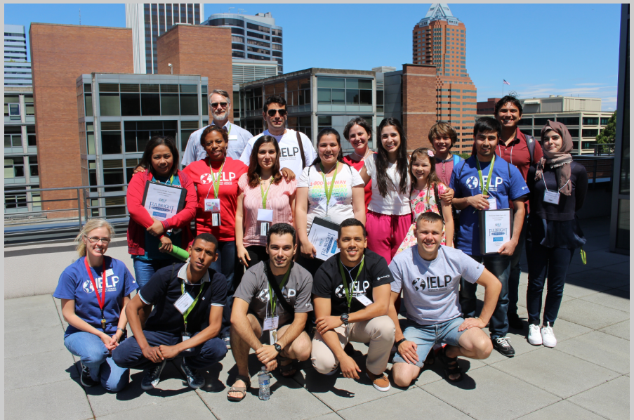
2017 Summer Fulbright Scholars

Since 2015, the Intensive English Language Program at Portland State University has had the pleasure of hosting a different group of Fulbright