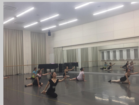
Shobi University dance students practicing for their final performance!