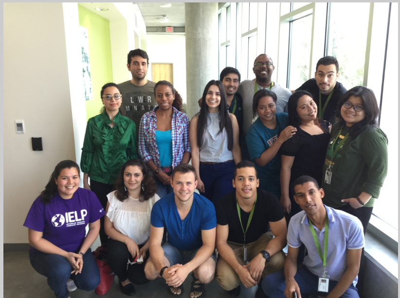
2017 Summer Fulbright Scholars

own experience and enhancing their readiness for their graduate degree programs. Furthermore, as feedback from IELP staff and Portland-area locals has confirmed, the experience, insight, and warmth of the Fulbright scholars has enriched the lives of those who have had the good fortune of interacting with them.