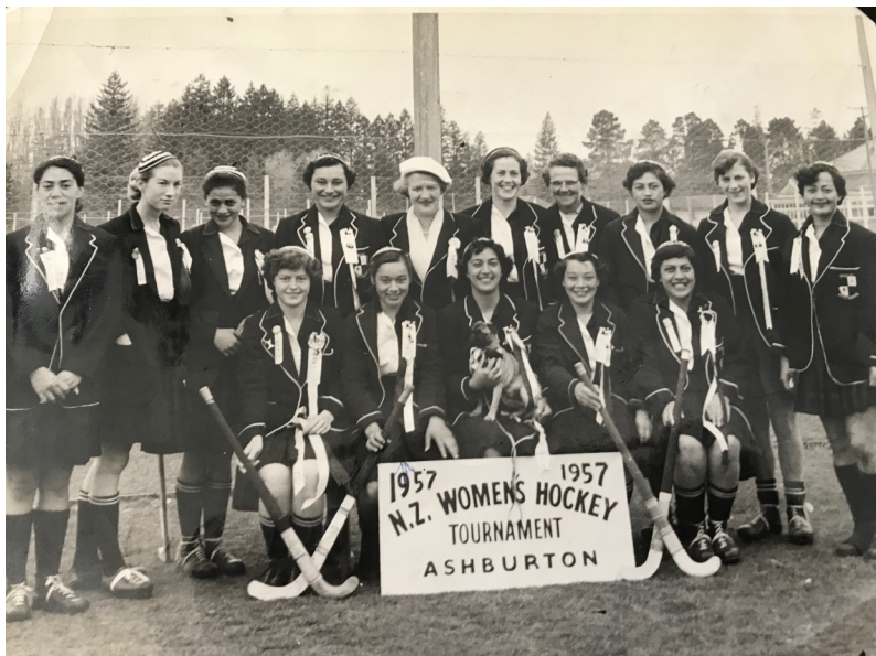
1957 N.Z. WOMENS HOCKEY TOURNAMENT ASHBURTON