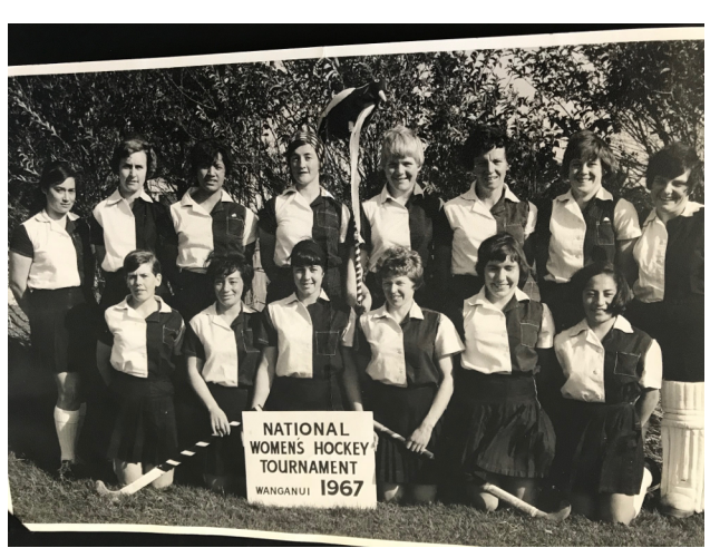
Hawke's Bay Women 1957