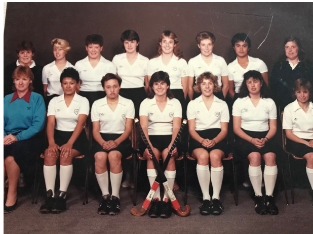
The 1985 Hawke's Bay Secondary School girls team.